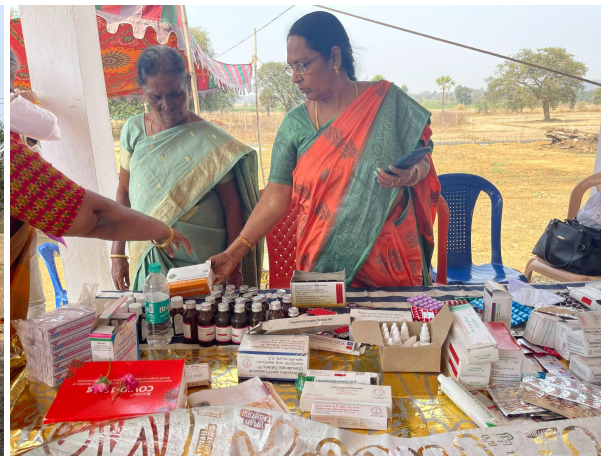
A church run medical clinic