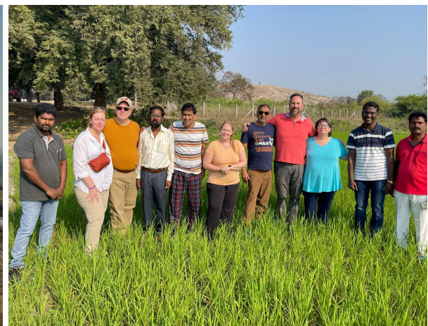
Standing in rice paddies