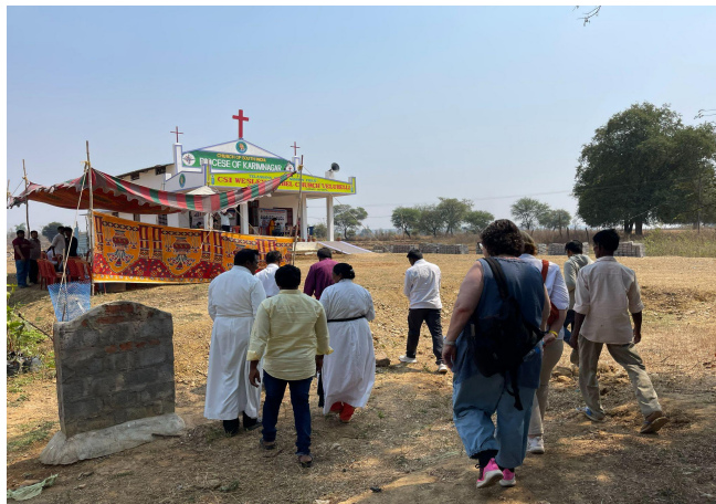
Visiting a new church start