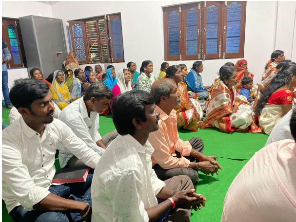
A rural church in Karimnagar