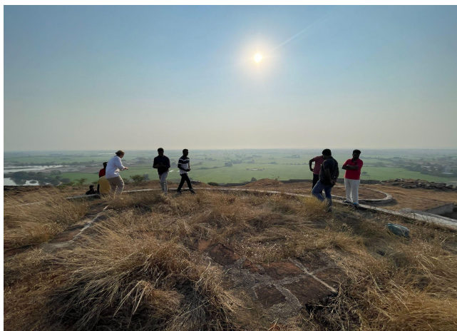
The View from Buddha Hill